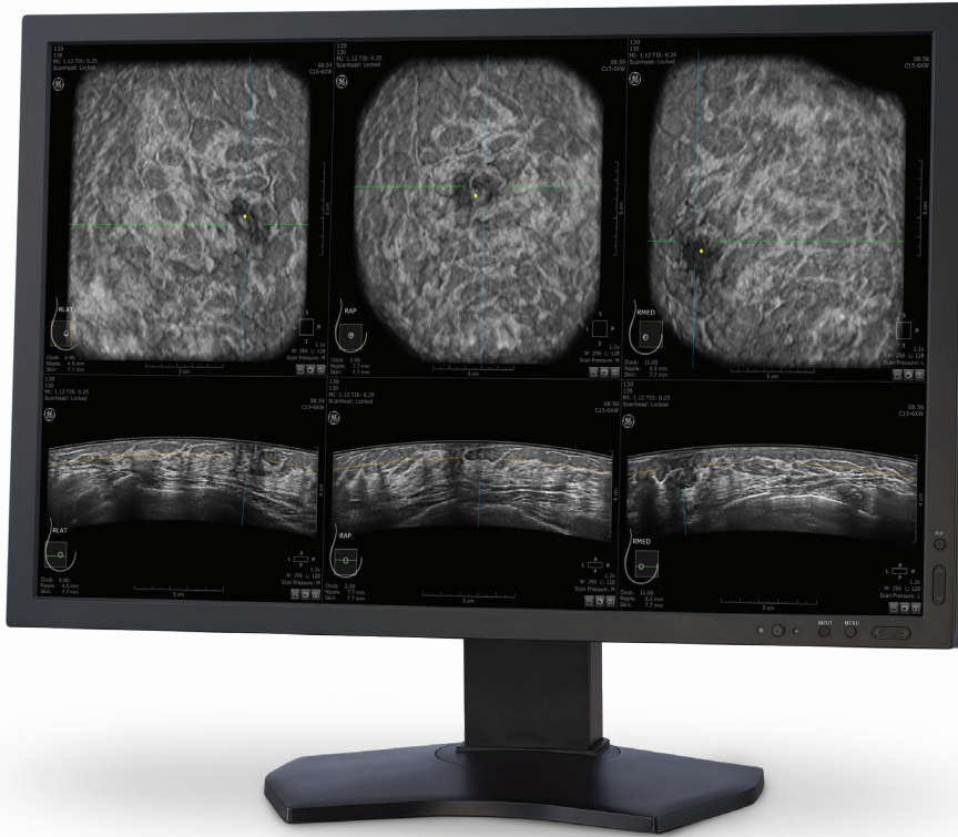
Invenia ABUS Viewer displays 3D volumes in a patented, 2-mm-thick coronal slice.

Invenia ABUS 2.0 uses the powerful cSound™ Imageformer, a software-based graphics processor, that provides a reproducible and operator-independent acquisition method to achieve consistent, high quality results. cSound imaging allows significantly more data to be collected and used to create every image. Traditional hand-held ultrasound parameters such as focal zones and gain are automatically optimized. Because no image manipulation is required, high image quality is consistent from operator to operator with the touch of a button.