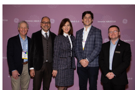
ABUS call for proposals 2, prospective research awardees

As mentioned in our last newsletter, the Retrospective Call for Proposal Awardees were announced in October at the ABUS User Meeting in Broomfield, CO. Learn more about their research projects and their thoughts on ABUS research here .