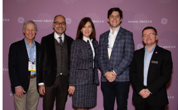
ABUS call for proposals 2, prospective research awardees